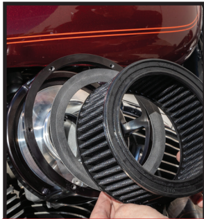
Install filter gasket ring into cage, Lube both filter bases with O-ring lube and install into cage

1. Lube both bases of the air filter to seal filter to cage & cover. Install filter gasket ring into cage, and Insert air filter.