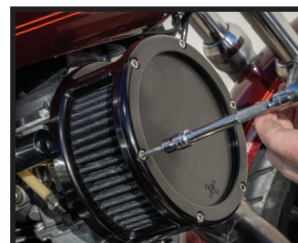
Final torque cover bolts to 30 in/lbs.