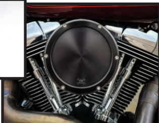
Install cover with logo at the six o'clock position